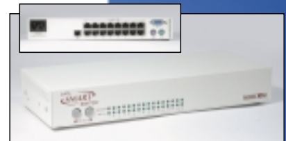
Smart CAT5 Switch, 16 Ports