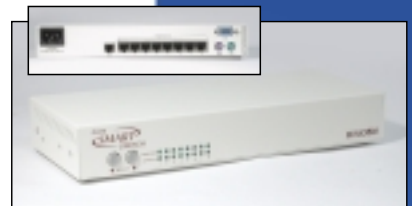
Smart CAT5 Switch, 8 Ports