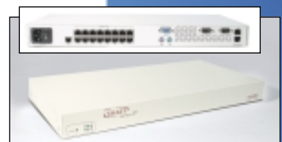
Smart 16 IP Switch