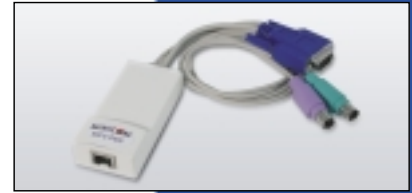
RIC PS/2 Cable (also available for SUN & USB)