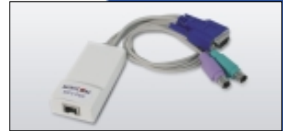
RIC PS/2 Cable (also available for SUN & USB)